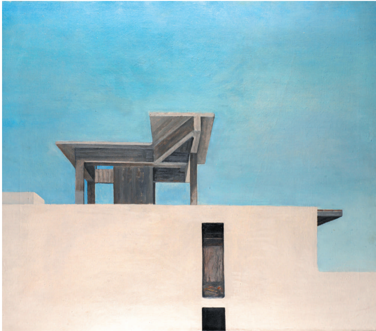
“Construction Site”, 1966. Oil on canvas, 55 x 65 cm.

Both. For me, the medium has always been an ongoing quest. I’m interested in how different media can