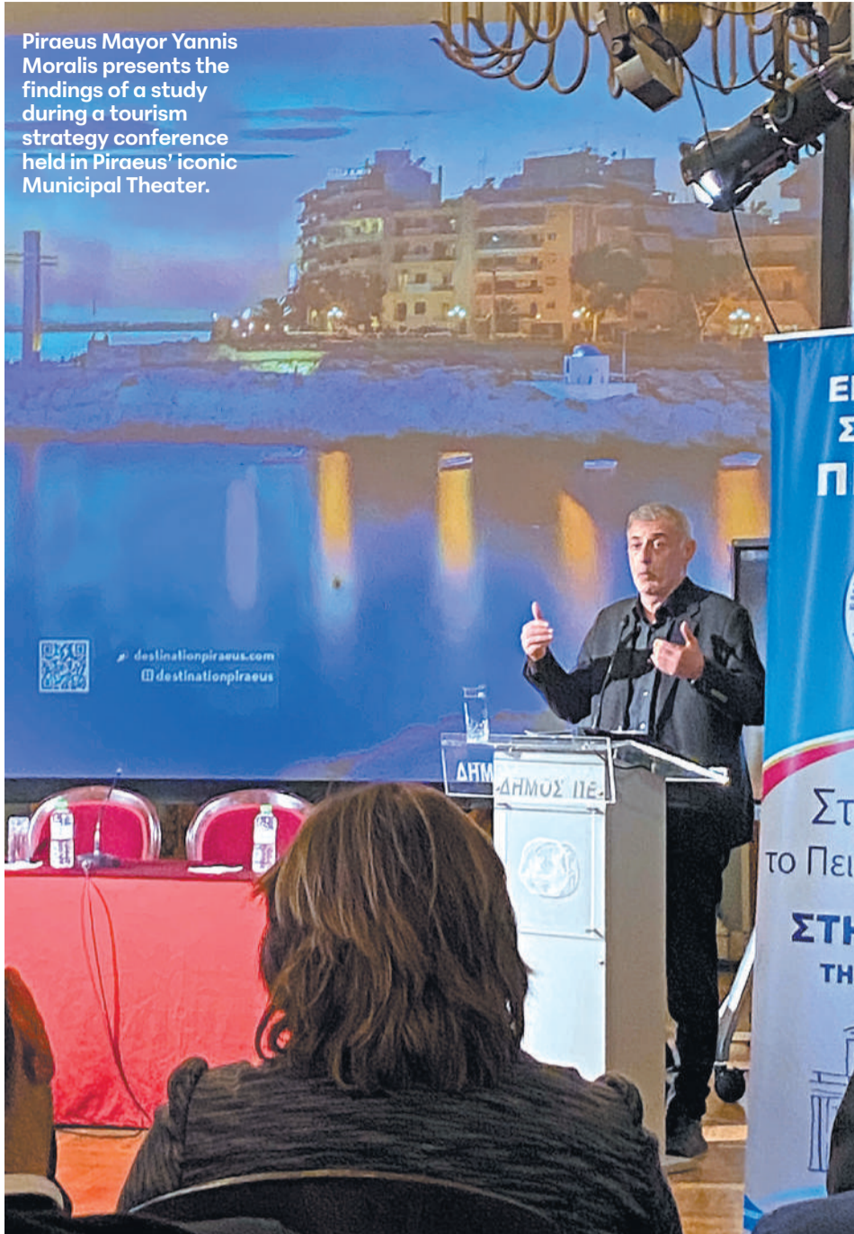
Piraeus Mayor Yannis Moralis presents the findings of a study during a tourism strategy conference held in Piraeus' iconic Municipal Theater.