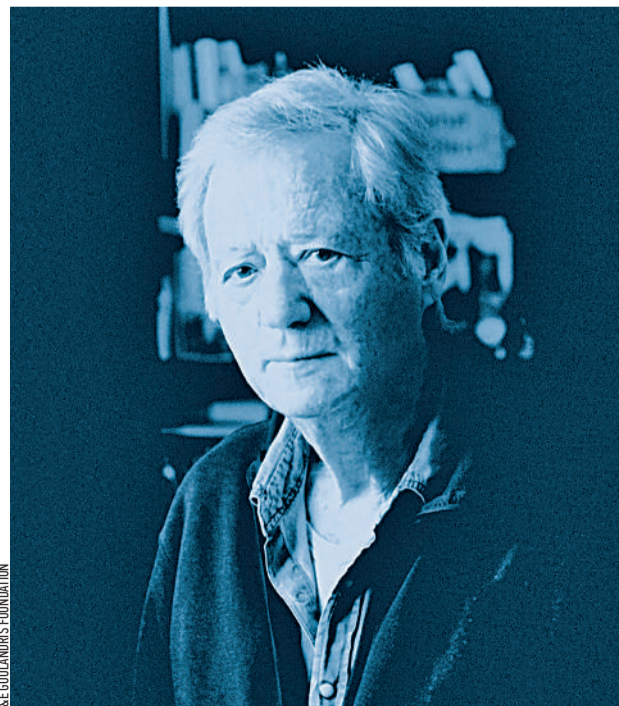
BEE GOULANDRIS FOUNDATION

"The things I don't want to forget." I don't mean the artworks themselves mustn't be forgotten; what we must never forget is who we are—and the entire constellation of experiences, people, and conditions that made you who you are. In other words, our sense of being part of a community. That is what is truly precious—to be able to feel you're not alone in this world. And from that flows the question of how to show solidarity. For me, the concept of solidarity is the ultimate necessity—and, at the same time, contemporary society's greatest loss. There—hold onto that.