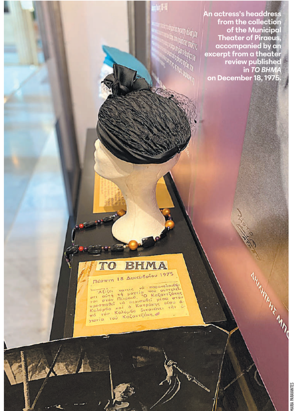
An actress's headdress from the collection of the Municipal Theater of Piraeus, accompanied by an excerpt from a theater review published in TO BHMA on December 18, 1975.

ism as one of the city's most underutilized assets. He also pointed to the future Museum of Underwater Antiquities as a potential "game changer" capable of reshaping Piraeus' tourism profile.