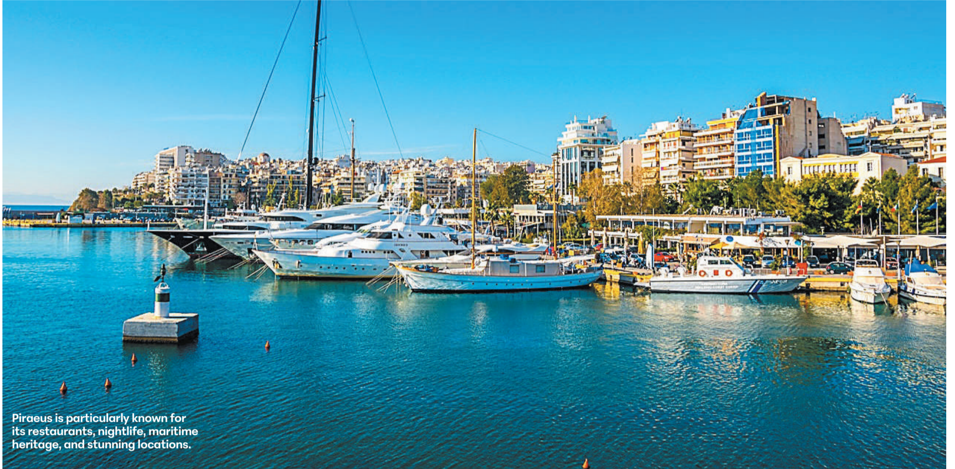
Piraeus is particularly known for its restaurants, nightlife, maritime heritage, and stunning locations.

Can Greece's largest port become a city break? Long overshadowed by Athens, Piraeus is taking steps to reinvent itself on its own terms