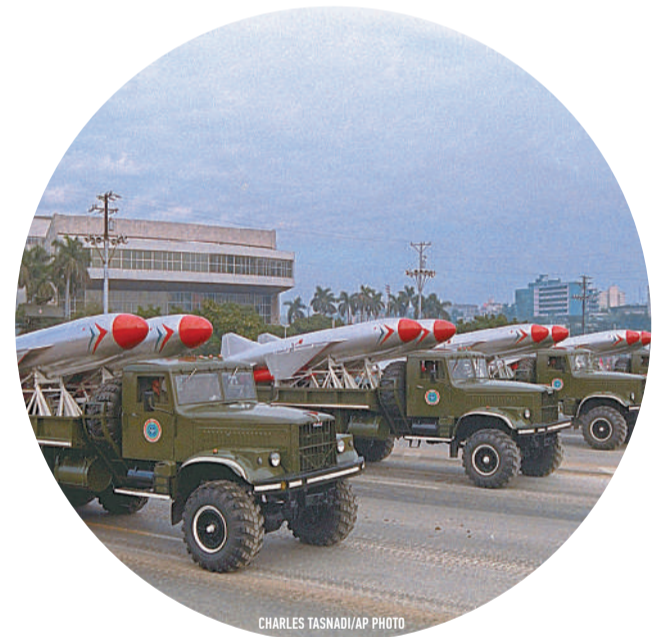
Armed parade in 1986, in Havana's Revolutionary Square commemorating President Fidel Castro's landing in southeastern Cuba in 1956, to start his revolution against Batista.