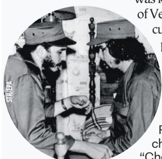
January 1959: Fidel Castro (L), chatting with Ernesto "Che" Guevara (R).

Perhaps the most damaging event for Cuba's regime was January's U.S. military raid that captured Maduro at his military headquarters in Caracas. Thirty-two Cuban soldiers and intelligence officers who were part of his security detail were killed in the attack. The end of the Maduro regime also ended vital Venezuelan oil shipments to the island.