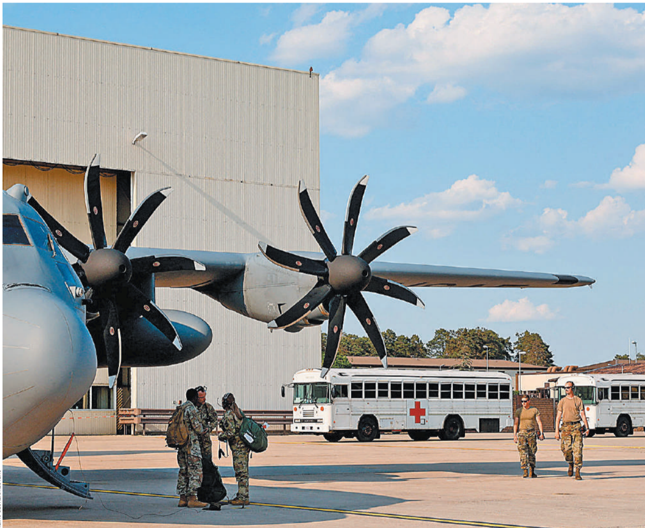
Servicemen attend the annual multinational crisis response training Saber Guardian 23 Hospex Operation with a medical focus, at the U.S. Air Force Base in Ramstein, Germany, June 6, 2023.

From the far right to far left, parties representing a third of voters are cheering Trump's drawdown punishment