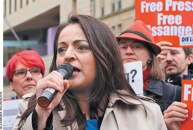
Sevim Dağdelen of The Left party speaks during a rally in Berlin, Germany, April 12, 2019.