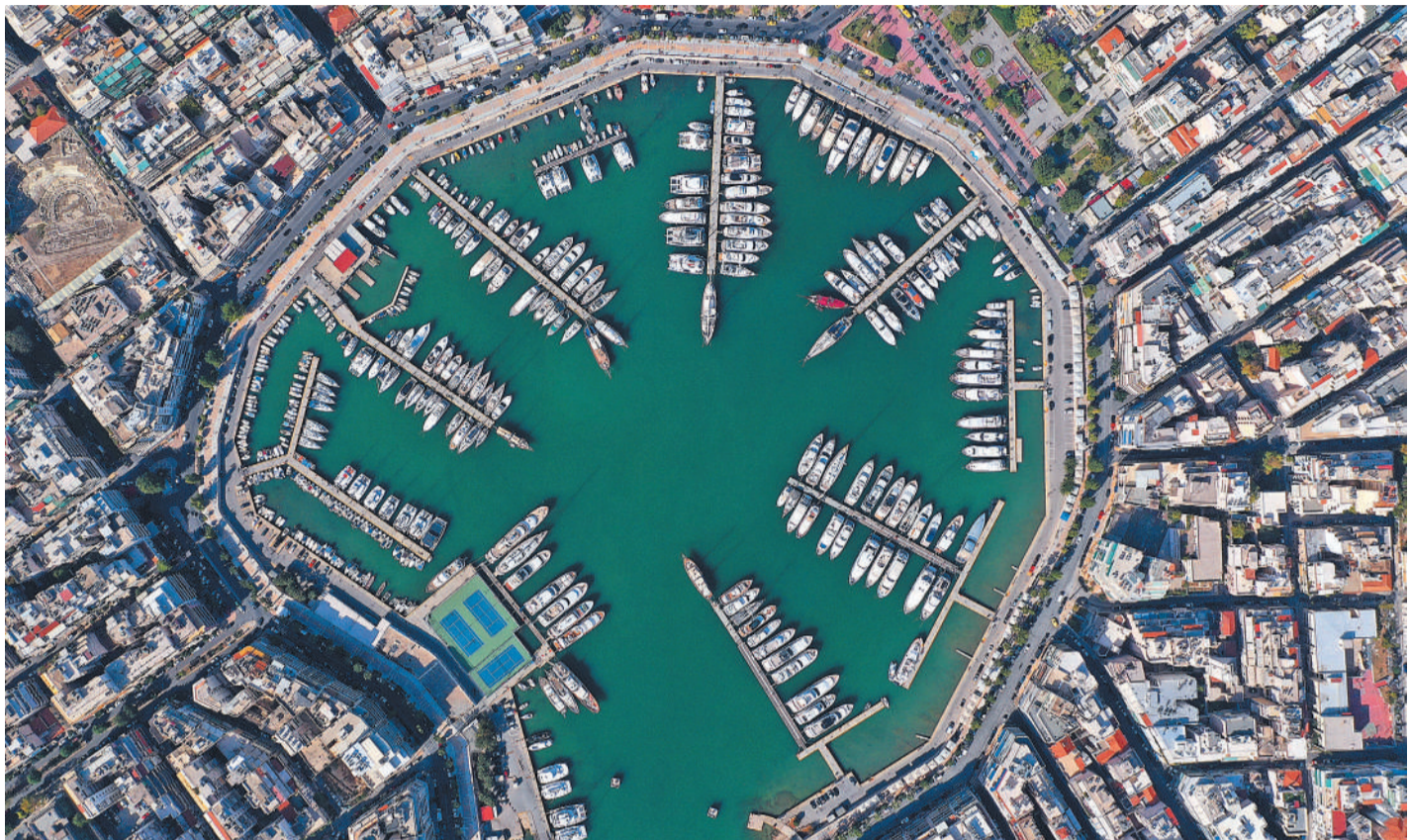
An aerial image, taken by drone, of the cyclical harbor known as Pasalimani, or Marina Zeas, off the center of Piraeus.