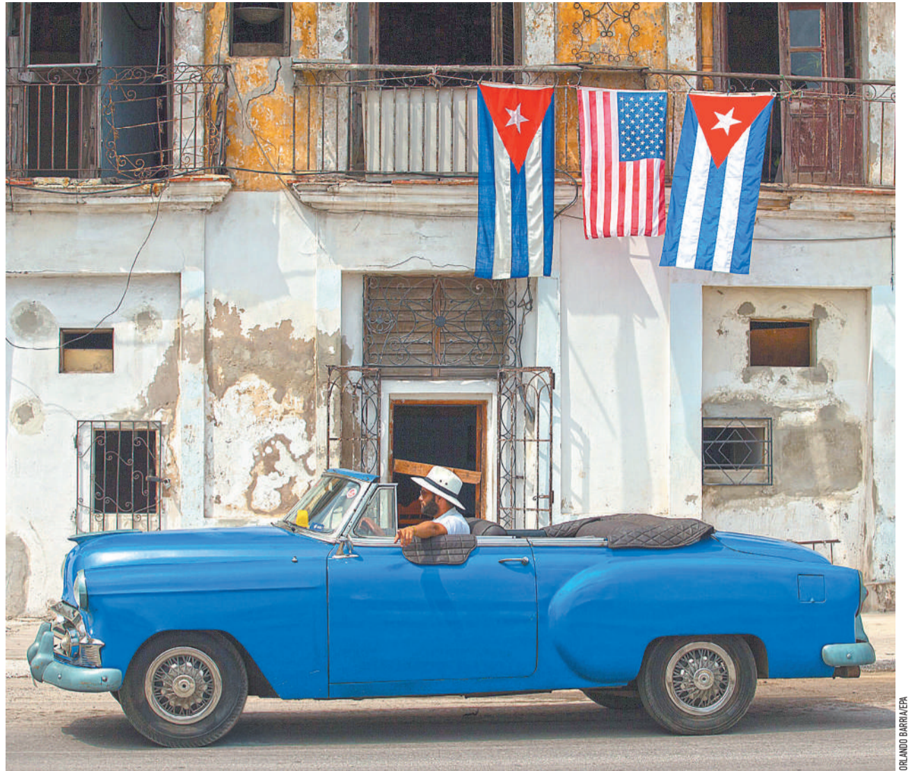
An old car passed by a house decorated with the flags of the United States and Cuba in Havana, as the island was preparing for the visit of U.S. President Barack Obama, March 20, 2016.

of the Cold War. Its security force is now a shell of its former self. But the memory of Cuba's global military adventures helps inform the Trump administration's view that it remains a threat to the U.S.