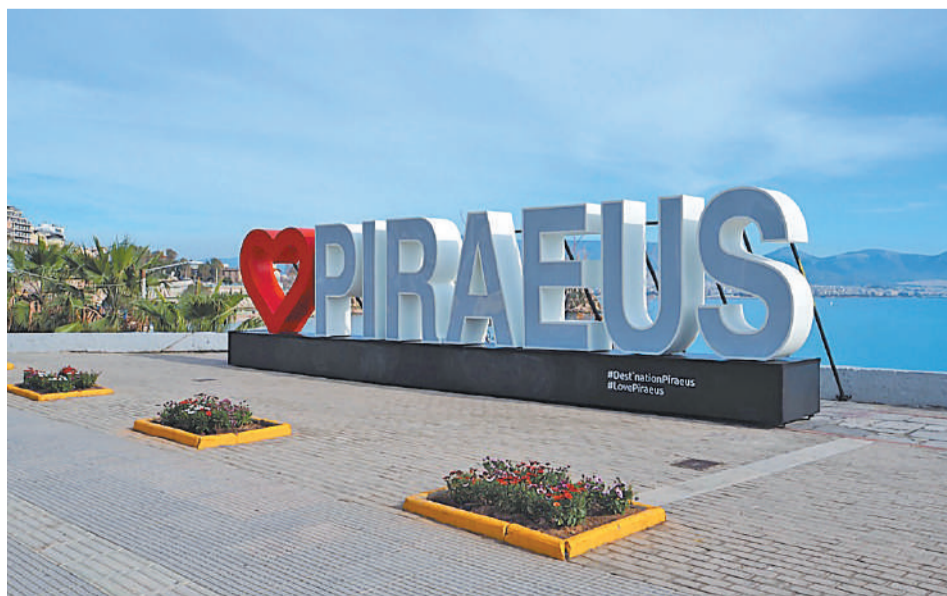
Despite being Greece's largest port and one of Europe's most important maritime hubs, very few travelers consider Piraeus a destination in its own right.