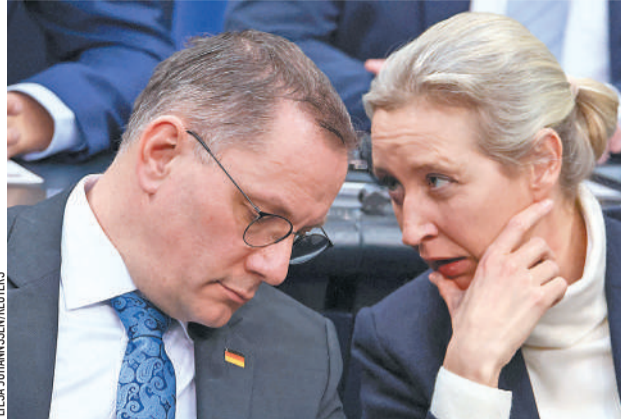
Tino Chrupalla and Alice Weidel, co-leaders of the Alternative for Germany party (AfD).

As he welcomed the Pentagon's announcement, Chrupalla praised Pedro Sánchez, the left-wing prime minister of Spain, for refusing to let U.S. aircraft on combat missions in Iran