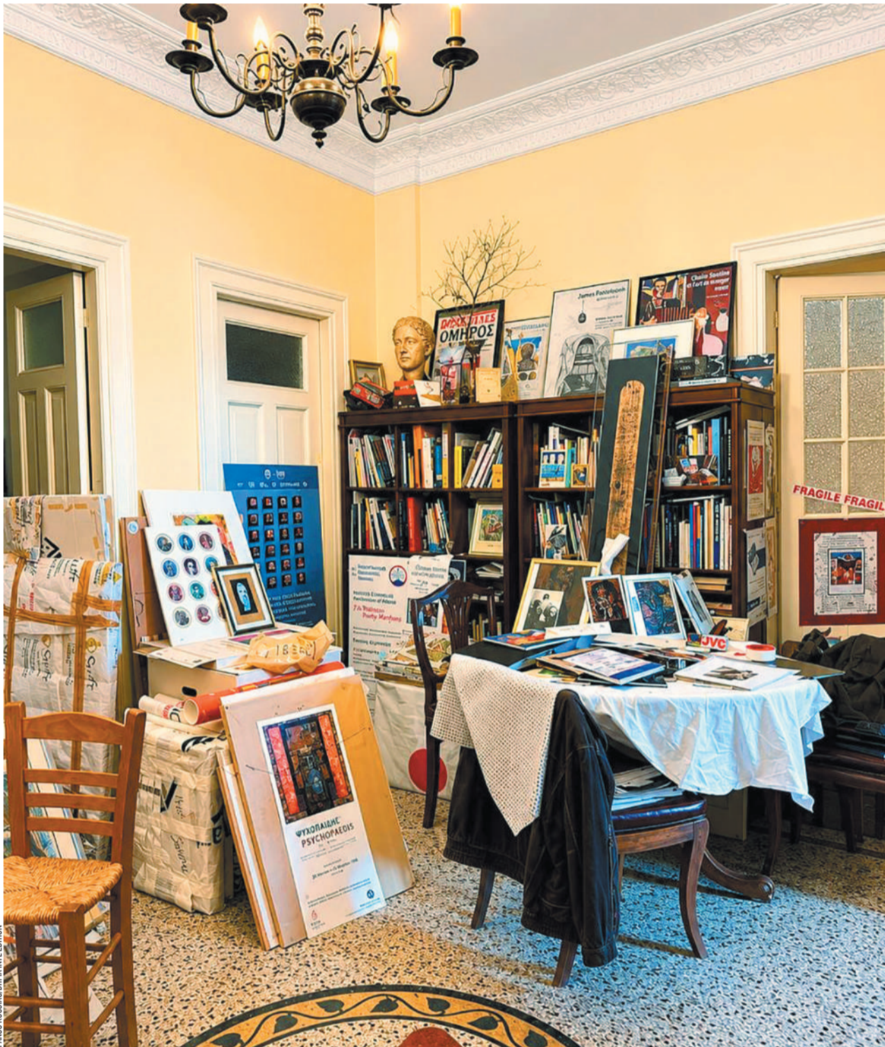
The artist's atelier — organized, creative chaos.

Then came the Center for Visual Arts (KET). There were twenty of us artists there, with a very specific concept: no middlemen. No gallerists, no dealers, no institutions between us and the public. We wanted to be entirely responsible for our own space and our own work. For producing, showing, and selling it. It was a very pure, almost radical model. And it worked for a while. Years later, when I was living abroad, I was back in Athens and happened to pass by the old shop we'd converted into a gallery back then, near the Polytechnic. I found myself looked for our old sign. But instead of "KET" on the frontage, I saw "PARKET" (Parquet) in huge letters. A business had moved in that sold flooring and wood. And I said to myself: "Look how far society's sunk. KET's great and revolutionary ideas have ended up on the floor as PAR-KET."